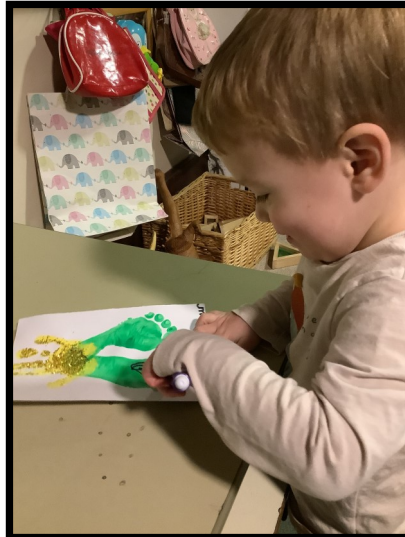
Christmas craft time!