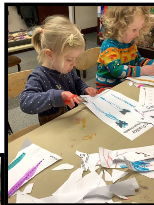
Practising our scissor control.