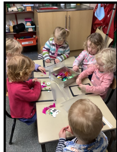
Making stain glass windows for Christmas.