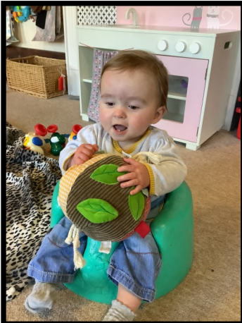
The texture ball is great fun!