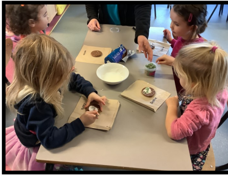
Good finger painting control when decorating our trees.