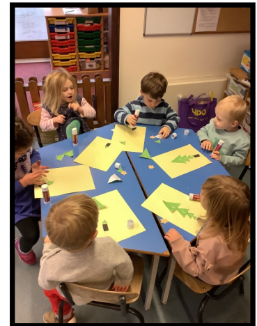
Shape and number Christmas Trees.