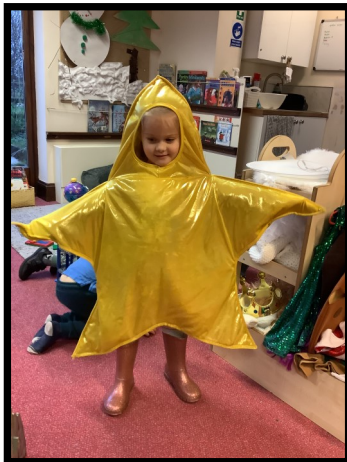
Look at our super stars!!!