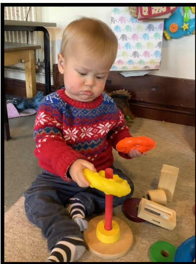
Showing good concentration whilst putting the hoops onto the pillars.