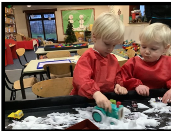
Snow sensory tray fun!