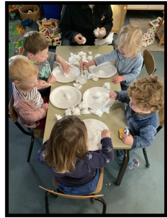
Would you like to build a snow man?