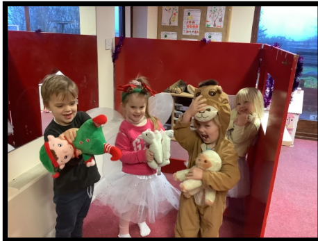
Having fun dressing up in festive costumes.