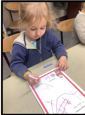
Writing letters to Father Christmas.