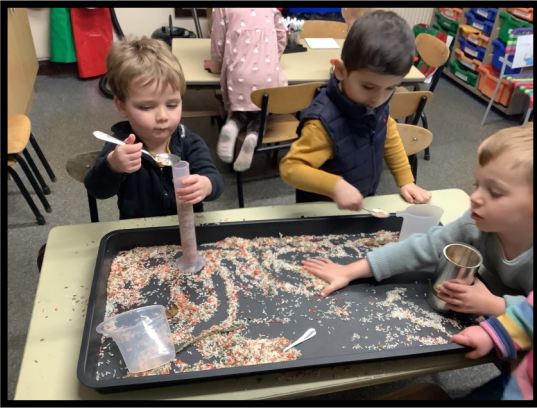
Exploring the sensory tray.