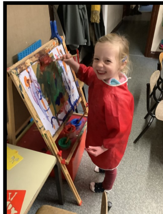
Look at what I'm painting!