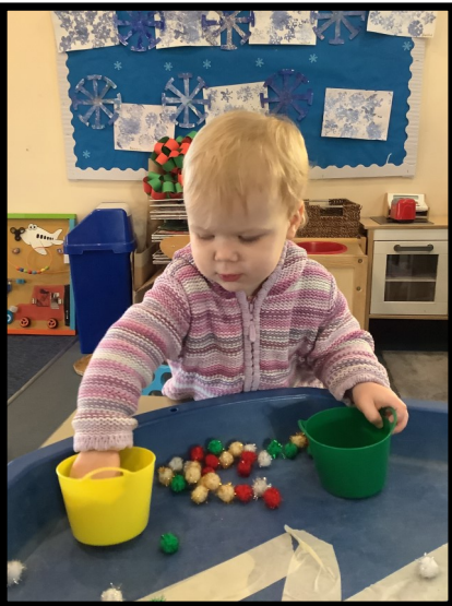
Having fun sorting the pom-poms.