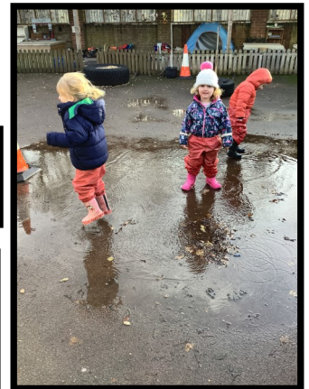
Puddle splashing fun!