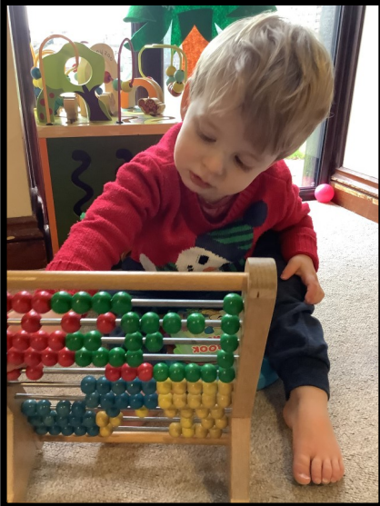
Exploring the abacas frame.