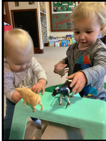
Playing alongside each other.