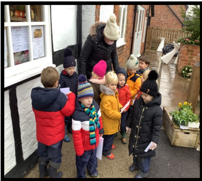
Posting our letters to Santa at Ashleworth Shop.