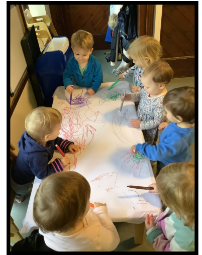
Mark making together.