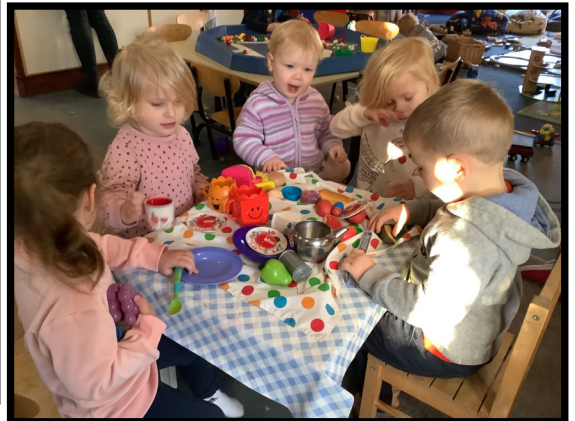
Would you like to join our tea party?