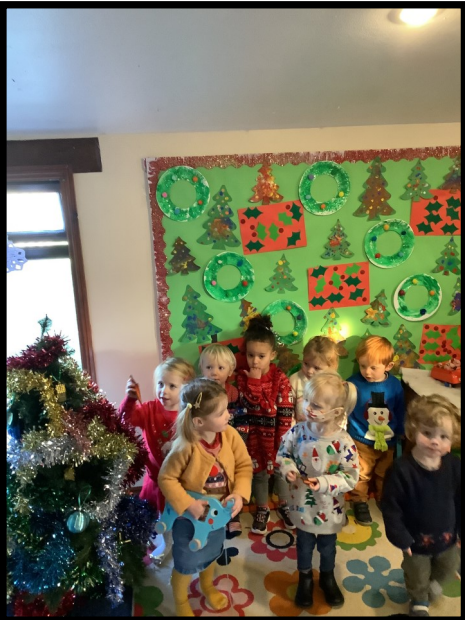
Christmas jumper day.