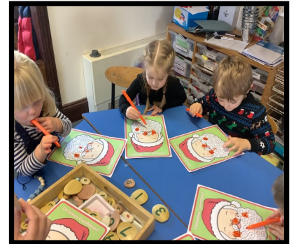
Playing Santa Bingo.