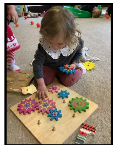
Working out how to make the cogs move.