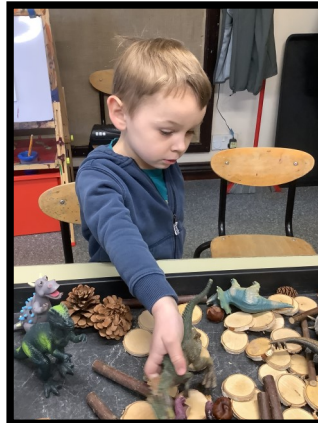
Making the Dinosaurs a cosy house.