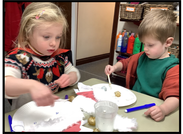
Christmas Craft time!