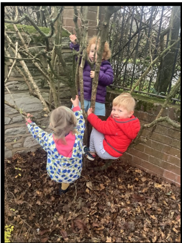
Climbing trees is great fun!