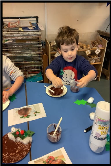
Making Christmas Puddings!- sticky ones and edible ones!