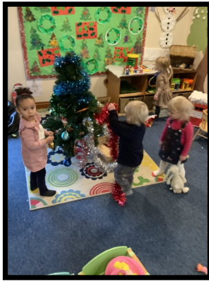
Decorating the tree together.