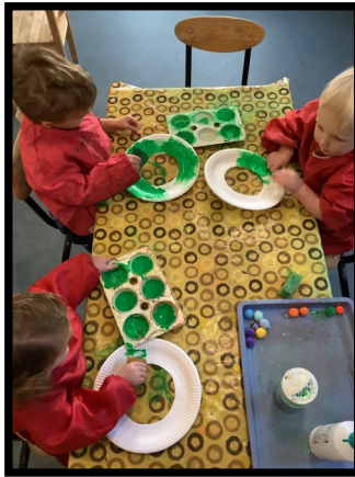
Lots of paint and glitter.