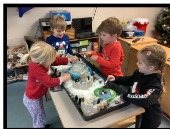
Having fun in the Winter Wonderland sensory tray.