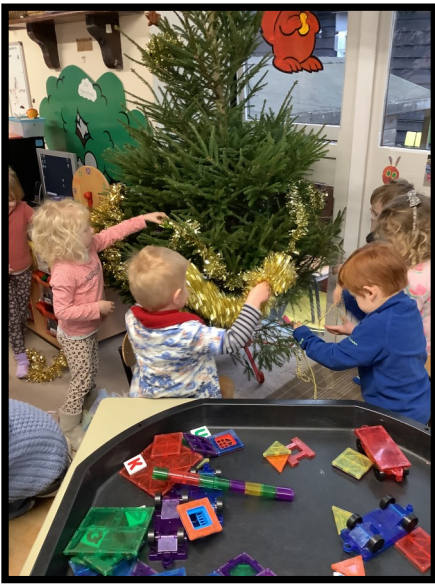
Decorating the tree together.